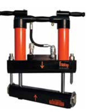
FOOTAGE C600 • For 2" - 6" diameter pipe