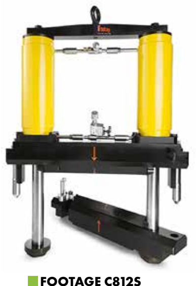
• For 8" - 12" diameter steel pipe