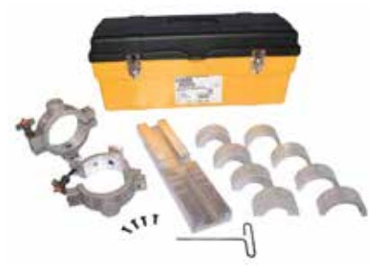
• For 2", 3" & 4" IPS