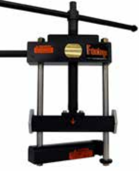
FOOTAGE C156 • For 1" - 4" diameter pipe