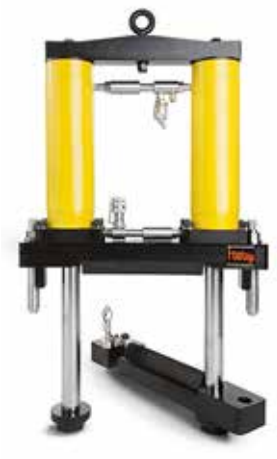
FOOTAGE C36S For 3" - 6" diameter steel pipe