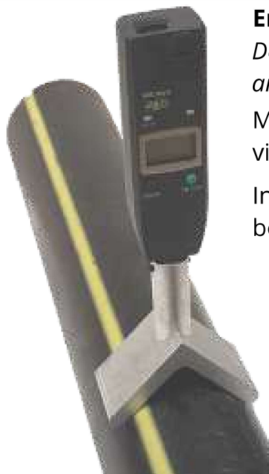
Part # 71-370002

Ensure your PE pipe wall damage is 10% or less!