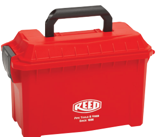
Protective carrying case included.