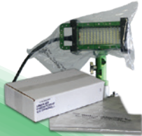
Paint Overspray Protection Bags (50 pack)