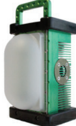
High Dome Diffuser