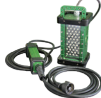
Various Cord Lengths & Plug Options Available (shown w/ NATO Plug Option)