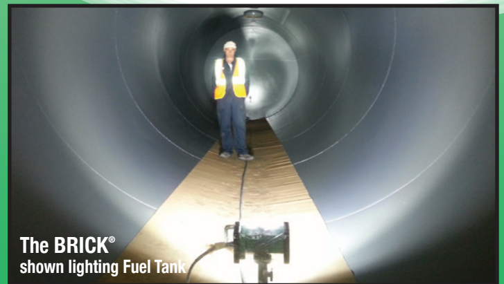
The BRICK ® shown lighting Fuel Tank