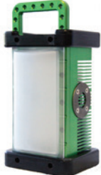
Roll Top Anti-Glare Diffuser