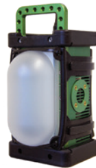
The Body Wrap