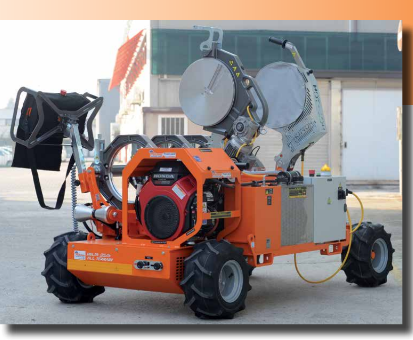
Gasoline or Diesel generator available