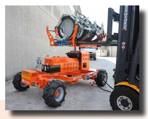
Only machine body lifting