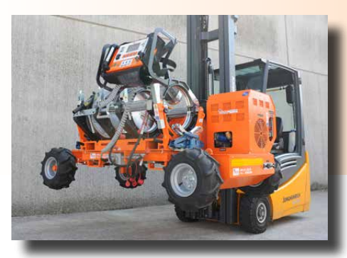
Delta 355 All Terrain lifting

Inserts Ø 125 ÷ 315 mm; Ø 4"÷ 12" IPS; 4"÷ 12" DIPS; Tool for flange necks, HS 355 rollers, Print, Kit for for IN-DITCH use, Plug for network power supply connection, Lifting kit.