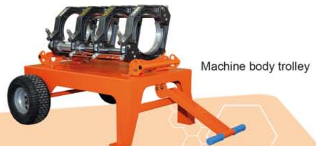
Machine body trolley