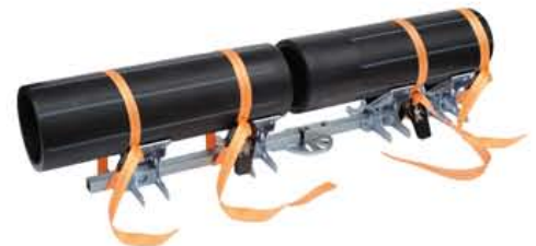
Configuration for "in line" welding