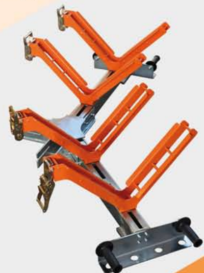
Configuration for 45° welding