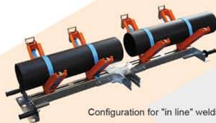
Configuration for "in line" welding

The aligner is available in two configurations: 2 axes and 3 axes (to weld T fittings).