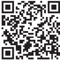
TriView Cold Weather Impact Video

The Rhino TriView is so durable and flexible that it can withstand repeated vehicle impacts up to 55 MPH and still snap back to its original upright position. The versatile post has ultraviolet light stabilizers that keep the bright color of the post from fading in the sun. The Rhino TriView is temperature stable from -40° Fahrenheit to +150° Fahrenheit.