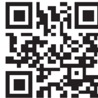
RhinoDome vs Rhino TriView Video