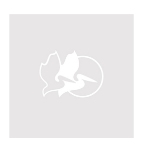
2220B Flashlight with battery only